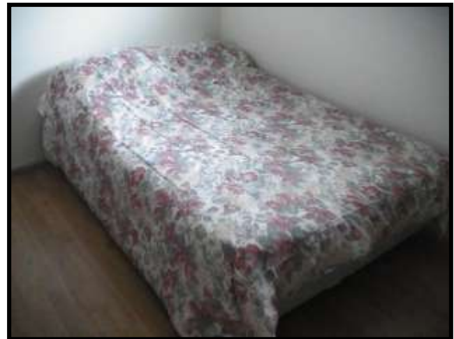
Bedroom 3 (Full Size)