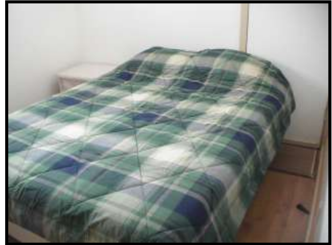
Bedroom 2 (Queen)